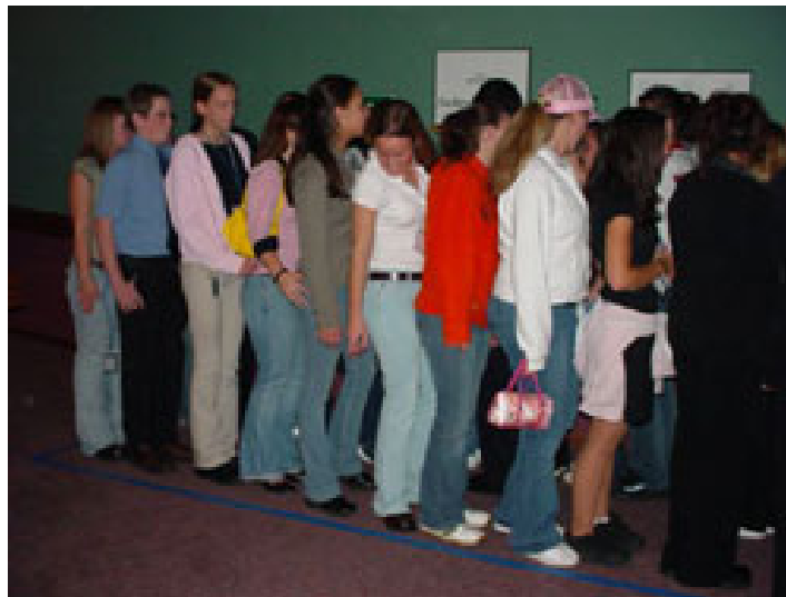
OLI Participants at the Leadership Adventure

us to become better leaders. His entertaining speech concluded this event with a bang and sent every eager FBLA attendee on their road to success.